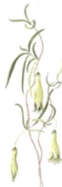
Botanical Illustration by L. Andrews