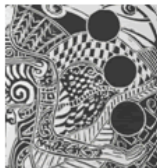
Lino cut print (detail) by Y. Atkins