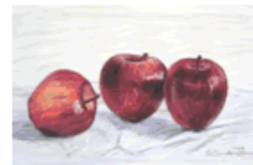
Still Life Drawing (above) & Life Drawing (below) by S. Anderson

DRAWING FOR FOLIO PREPARATION STILL LIFE DRAWING BOTANICAL ILLUSTRATION LIFE DRAWING